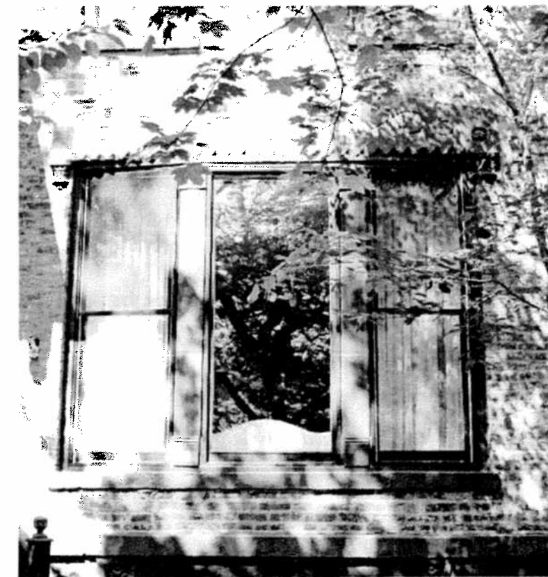
Above: A detail of the rare surviving wood cornice that ornaments the row houses in the district.